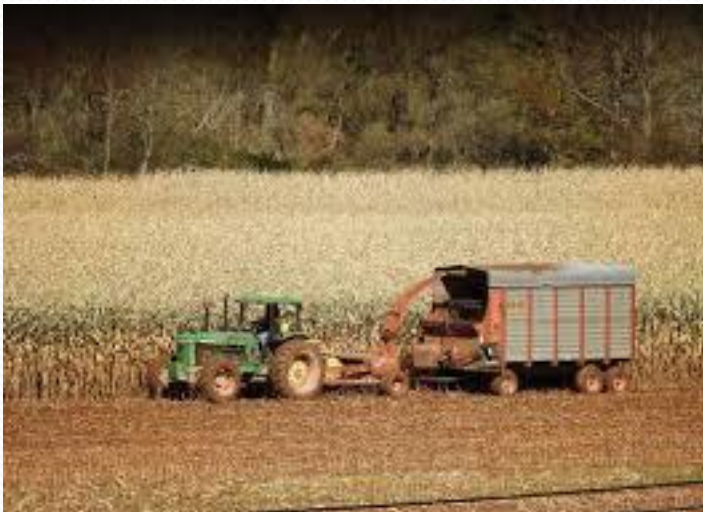
Watershed Agricultural Council