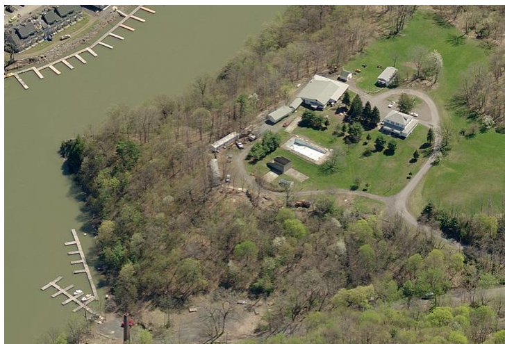
The Forlini property

Located on the southern bank of the Catskill Creek, Forlini's offers 30 wet slips and 8 slips dedicated to transient boaters. The marina itself offers limited service with no fuel, supplies or repairs available. The marina does provide access to bathrooms. The marina is located on a 24 acre property that includes the Hop-o-Nose and is characterized by steep slopes along the creek.